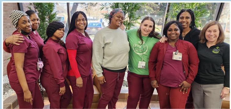
Sterling Heights and Eastpointe Centers