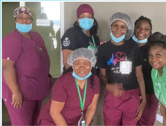
Dearborn and Pontiac Centers

The Home Care Team takes care of your needs at home! They can help with meal preparation, laundry, medication reminders, light chores, and more. The team consists of a Home Care Director, Home Care Manager, Home Care Schedulers, and Participant Care Associates.