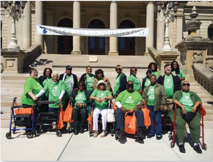
PACE Southeast Michigan Group at the Capitol

On June 2, a group from PACE Southeast Michigan went to Lansing, Michigan for Older Michiganians Day. This event gives seniors a chance to talk with officials about key issues. Our PACE Southeast Michigan group enjoyed the trip!