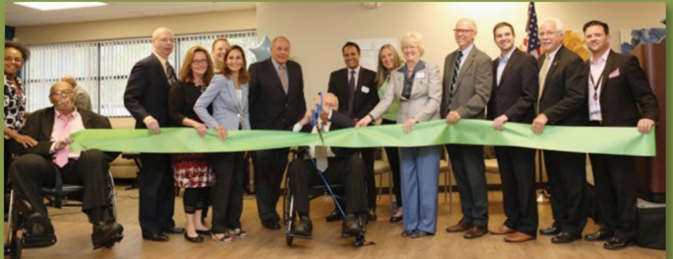
Ribbon Cutting at Southfield Center