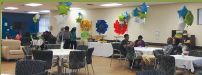
Caregiver Open House

Thanks to all who were involved with these events!