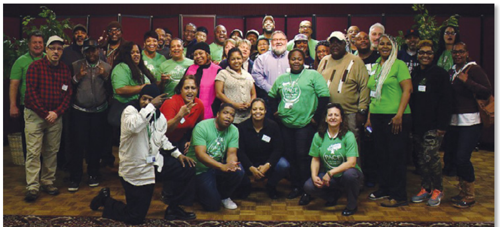
The Transportation Team